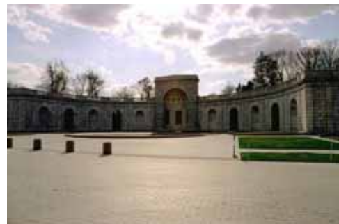
(WIMSA Memorial, Washington, DC)