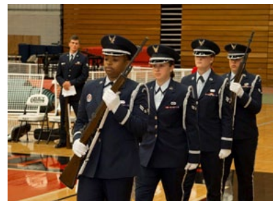
Whiteman AFB All Female Honor Guard