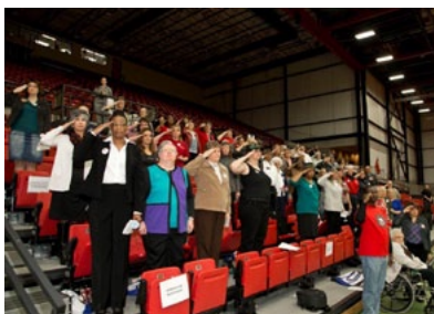
Women Veteran Attendees